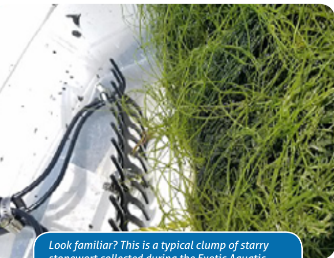
Look familiar? This is a typical clump of starry stonewort collected during the Exotic Aquatic Plant Watch on Woodruff Lake in Oakland County.

Both muskgrass and starry stonewort filter out nutrients from the water column and stabilize the sediment. However, because it grows at greater depths than muskgrass, starry stonewort can cover more area and fill more volume in the lake, potentially filtering out too many nutrients and choking the sediment.