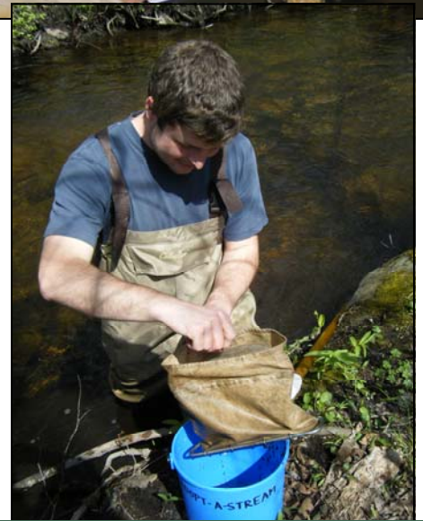
Volunteer collector emptying net into bucket for streamside volunteers (Spring 2011)