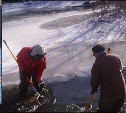
Winter Stonefly Hunt Collectors (Winter 2010)