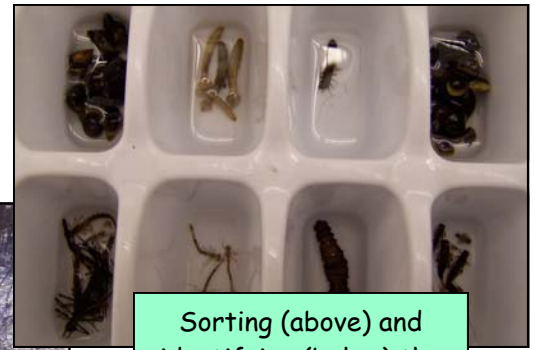
Sorting (above) and identifying (below) the macroinvertebrates on Bug I.D. Night (Spring 2010)