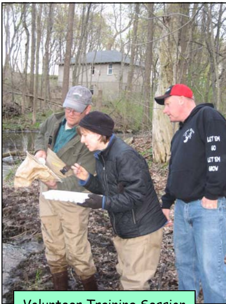
Volunteer Training Session (Spring 2011)