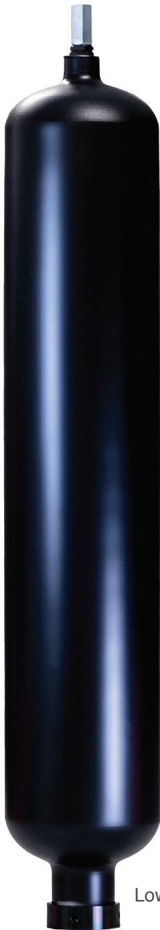
Low Pressure Accumulator 16.5 gallon (62 liter)